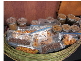
Traditional foods basket of foods from class.

This is a time to explore, gain skills and share knowledge about traditional native arts such as basketry, leatherwork, drum-making, beading, carving, wool weaving and more. It is also a time to practice and gain other important traditional skills such as food gathering, hunting, fishing and preservation, traditional foods recipes and herbal medicines.